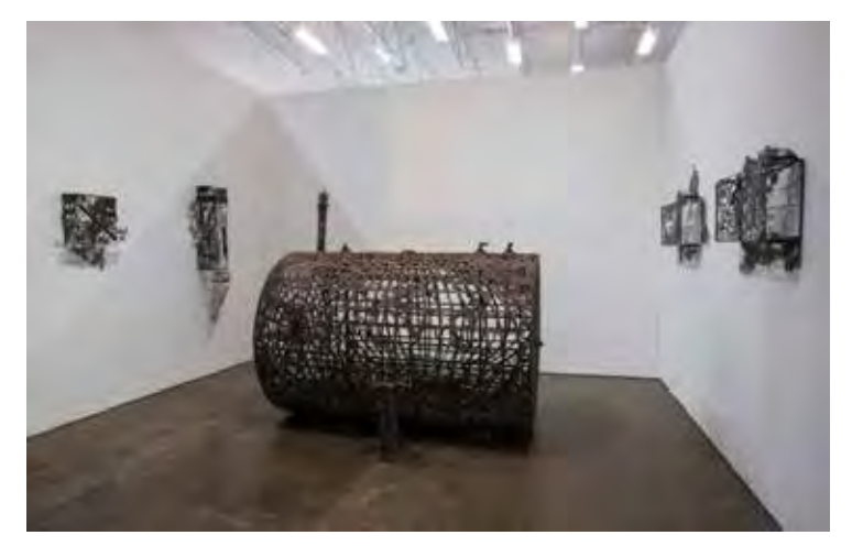
Cal Lane, Map of the World, 2010, Ammunition box 2, 3, 5, 8, 2014

Inside the fallow field Is a carved flowered oil tank. Hollow and open, I imagine a thousand men from Trinidad coming with pieces of colored candy, Hitting the steelpan instrument bringing Calypso music To the continent.