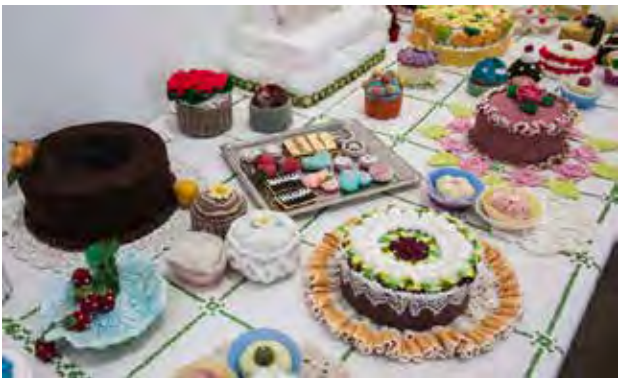
Orly Cogan, Confections, 2010 (detail)

But you are not quite as you seem. Not the sugar rush of the moment nor the mouthful of indulgence that I want to guiltily give in to . . . Like so much else, you are substantially, materially, at odds with the painstakingly fabricated picture you present. You are not the Candyland, the Willie Wonka Factory, the Dream Come True Birthday Party that my inner baby is a sucker for. No, you are a wonder work of a different stripe. Cotton and felt, not butter and milk. Not almond paste but yarn. And ribbon. Made with needles and hooks, not beaters and spoons. Not chocolate, strawberry, caramel, hazelnut, cherry ... You are fabulous, lovingly made, a jaw-dropping execution of craft and yet your flavors are strictly for the eyes and mind and even while I delight in them I will admit: Baby me is sad to learn this is a mostly grown-ups' pastry party and I cannot eat it.