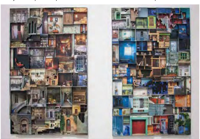
Chris Jones, When The Days Are Growing Shorter, 2016, Where Memory Is Traded, 2016

at the money shots: jutting hip bones, a concave rib cage, and a face like a hungry kitten, with enormous green eyes and a candy land mouth with a big juicy lower lip resembling a ripe strawberry. Number one stunner, they said. Teenage rampage. She reached for the bottle of Prosecco and necked it, checked herlook in the mirror smeared with yesterday's coke, and pulled her panties back up. Hashtagmeetoo, she whispered, and snapped the compact shut.