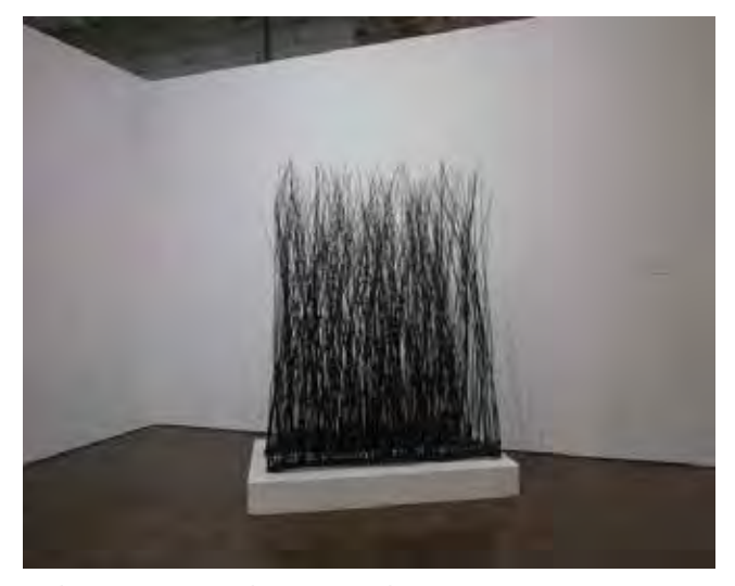
Barbara Korman, Looking at Woods, 2009

Like a constellation of stars the trees gathered in the park next to my house, tirelessly with inexorable energy their blossoms shine. I sing of the visible, the aural, sounds of merriment, and the gladdened hearts of those who reap, as I linger between two rows of trees and delicious sunlight. Life preys and they'll begin to falter. I ask not to fear the breaking of order and form. But these, these timeless trees, do not break. They soar and shine and stand the test of time.