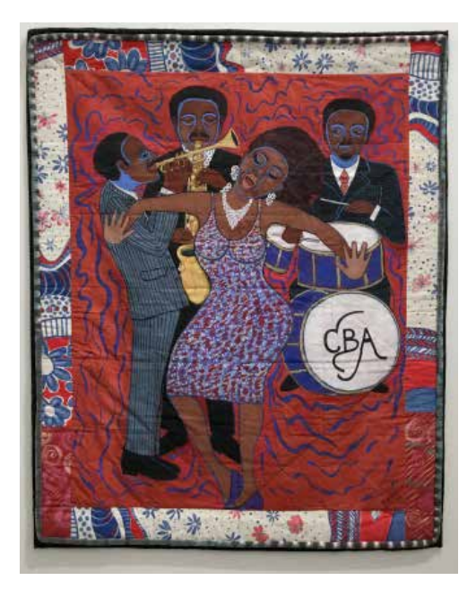
Faith Ringgold, Jazz Stories: Mamma Can Sing, Papa Can Blow #2 Come on Dance with Me, 2004

All you need is some Faith and a Ring of pure Gold a needle of steel that knows where to go some lively bright thread, strong fabric – a swathe -tunes that never get old and a mold you can break to dance off all your aches.