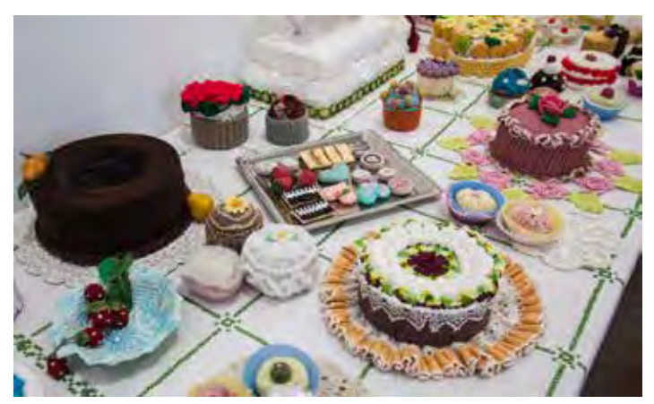
Orly Cogan, Confections, 2010 (detail)