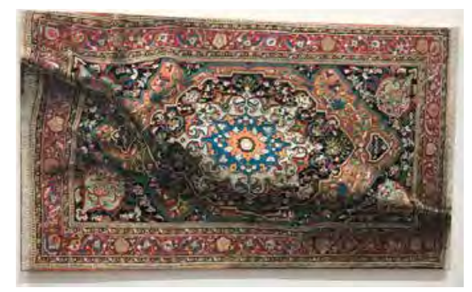
Antonio Santin, Arcana, 2015