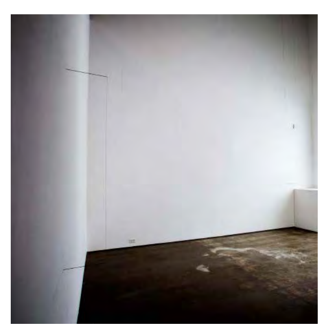
Jong Oh, Room Drawing (monochrome) #3, 2017