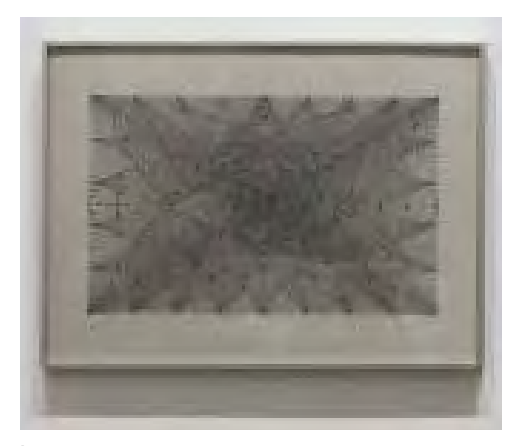
Laura Battle, Heart, 2005

When the punishment is meted out the sky will turn to copper, and the earth to steel. It will not rain and nothing will grow. But the Great Horned Owl will still roost on his large bare tree, eyes powerfully acute, and squirrels beneath will quicken their steps. Our stone-like heart will turn to flesh curled around its deep core. We will still embrace our children, closely, in the dusk and dread of night.