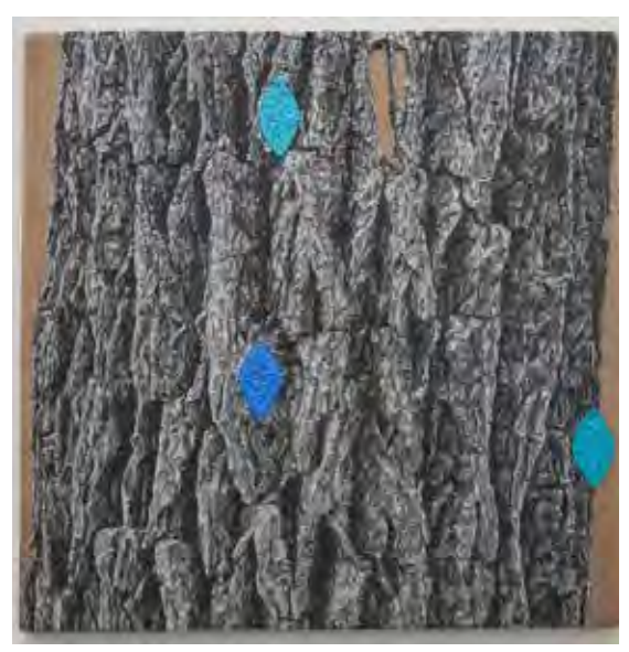
Cristina Alvarez-Arnold, Untitled, 2012-17

Amidst the green, one leaf blue, implodes.